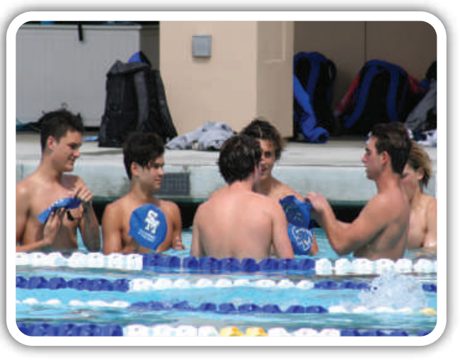
"If we do this just right, we can all fit inside of this super stretchy swim cap!"