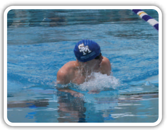
"Where did everyone go???!!!"